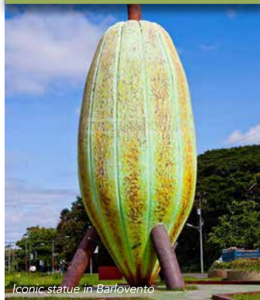
Iconic statue in Barlovento

Chocolate that captures unique terroirs made from a single variety of cocoa beans from the same region.